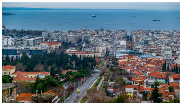
Leonidas Papadopoulos Photoworks ( https://www.facebook.com/papleophotoworks )